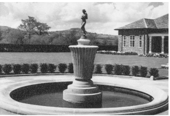
The factory gave employment to so many people over the years and not just to residents of Romsley and Hunnington. So many people have fond memories of working for Blue Bird's, visiting the village stores, attacking the toffees with the little hammers or just driving past the factory.