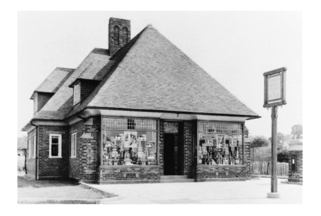
The management also provided recreational facilities for the workers and villagers alike.