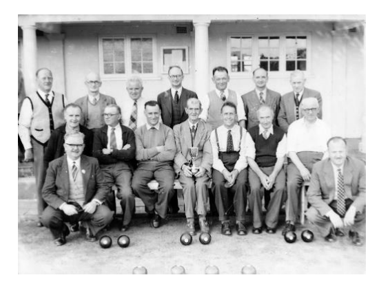
These photos are all taken from "Growing Up in Blue Bird's Garden Village", a recently published hardback book by Romsley & Hunnington History Society.